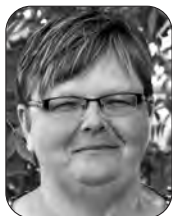
PRODUCTION Nicole Kapusta