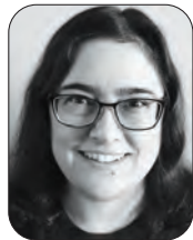
EDITOR Ashleigh Viveiros