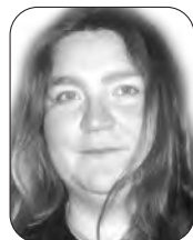
PRODUCTION Tara Gionet