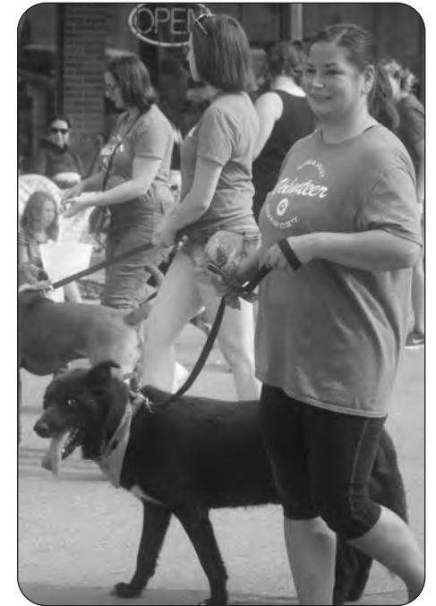
VOICE FILE PHOTO

Pembina Valley Humane Society volunteers walking in the Morden Corn and Apple parade last summer.