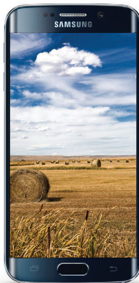
Samsung Galaxy S6 Edge