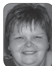
PRODUCTION Nicole Kapusta

The Winkler Morden Voice is published Thursdays and distributed as a free publication through Canada Post to 14,600 homes by BigandColourful Printing and Publishing.