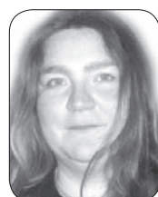
PRODUCTION Tara Gionet