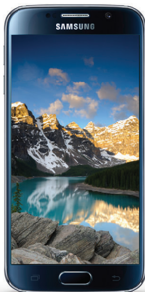
Samsung Galaxy S6

Get Canada-wide data with the new MTS MyPlan.