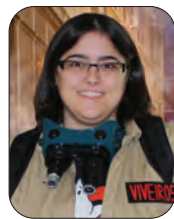
EDITOR Ashleigh Viveiros