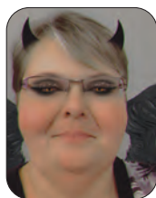
PRODUCTION Nicole Kapusta