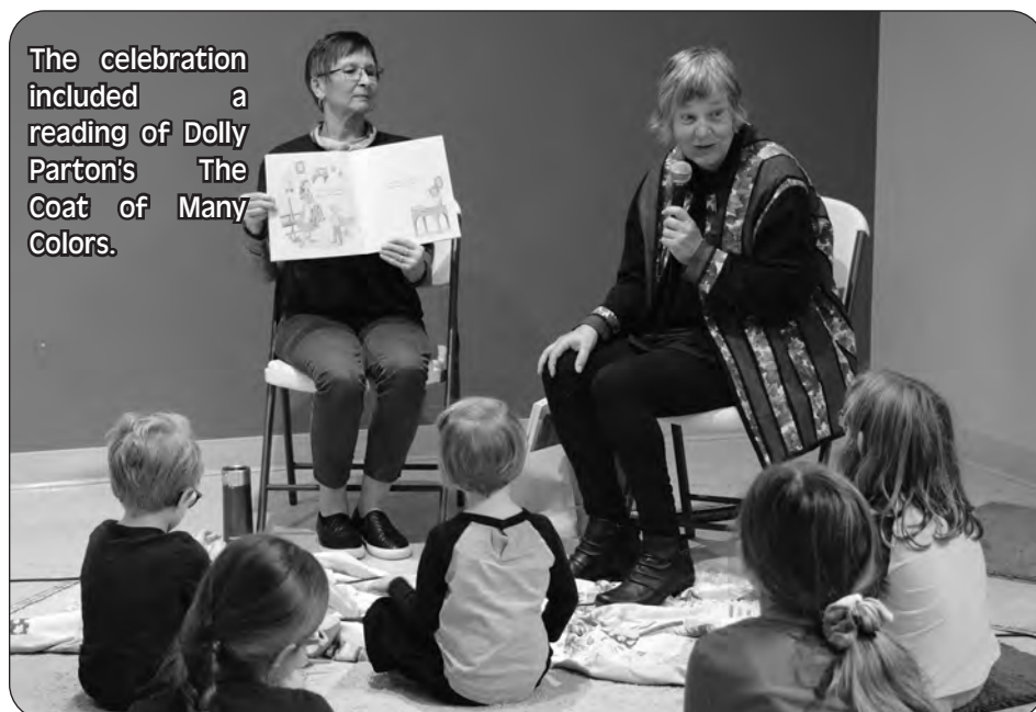
The celebration included a reading of Dolly Parton's The Coat of Many Colors .

You can learn more about the Imagination Library, make a donation, or get in touch with the board online at winklerfamilyresourcecentre.com .