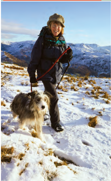
Going for walks during the winter, dressed in suitable clothing, is still the simplest and cheapest way of safely staying active.

Removable metal grips for shoes and boots appeared on the market a few years ago and they have proven very effective. A walking stick adapted to the user's height, with an ice pick fixed to the end, can help them maintain their balance on icy surfaces. This solution may seem bizarre, but it works very well! Hip protectors (underwear fitted with protective padding), can be quite effective in preventing fractures in case of a fall.