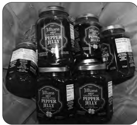
Jams, jellies and pickles are all from locally sourced fruit and vegetables.