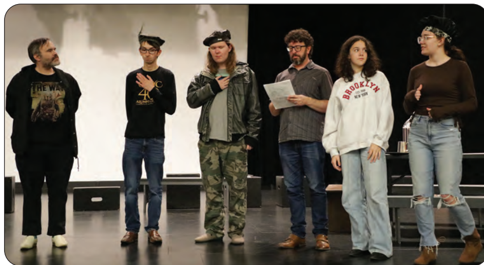
Flatlands Theatre Company actors run through scenes from An Act of Piracy, which has performances at the Winkler concert hall Nov. 7-10.