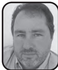
By Peter Cantelon

In combination with this season, we are also approaching the end of the year, which puts a certain pressure on certain people of certain levels of income to figure out where their charitable donations are going to ensure tax receipts are collect-