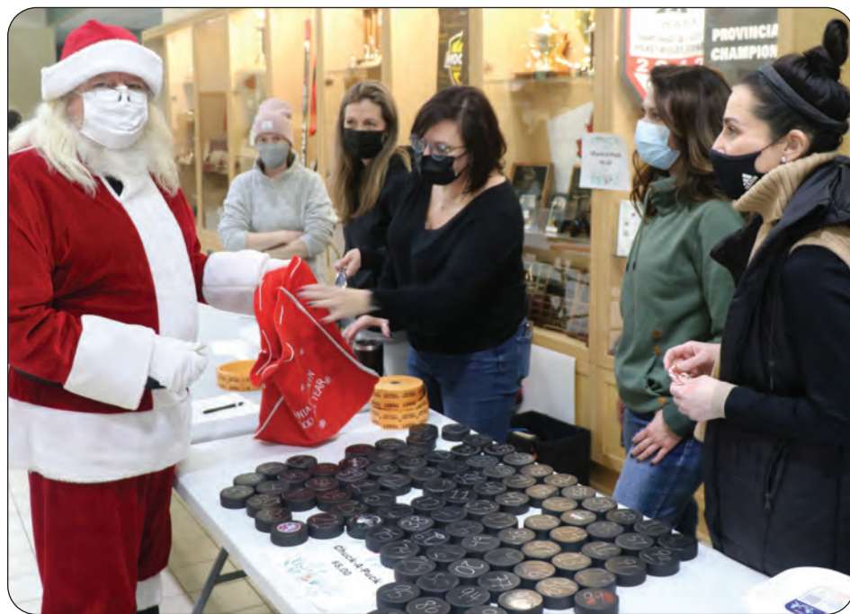
VOICE FILE PHOTO

"I think the boys really seem to buy into it. They usually get a lot of people out to the games, and that shows that a lot of people support them," Schel-